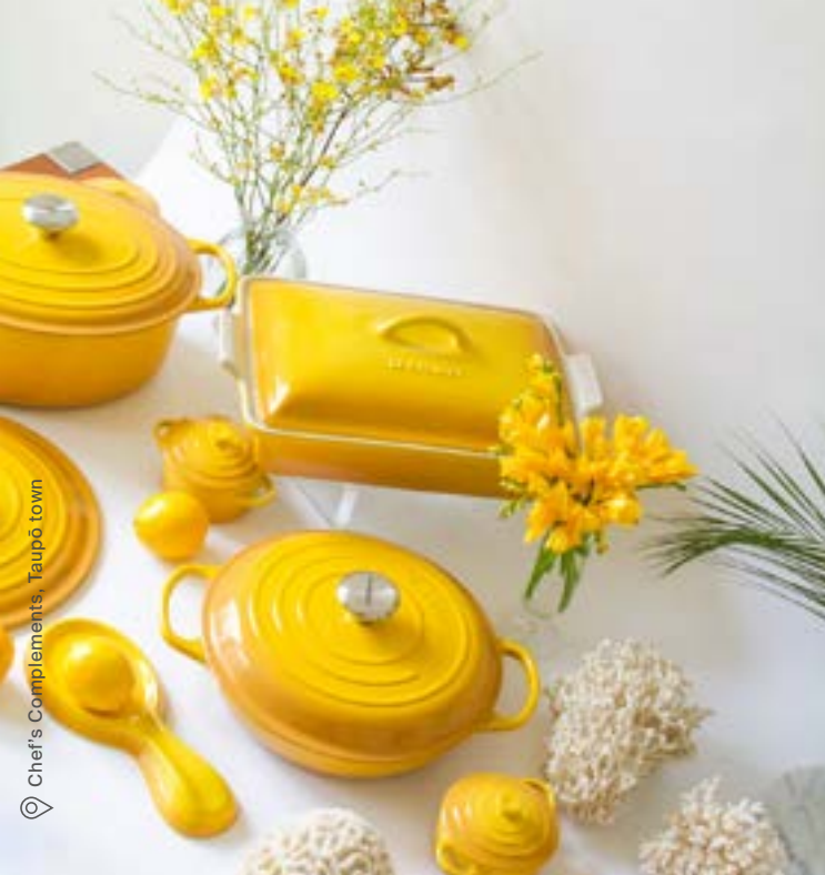
Chef's Compliments, Taupō town