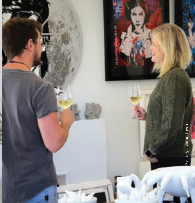
Zeal Art Gallery, Taupō town