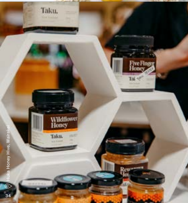
Huka Honey Hive, Waikareke