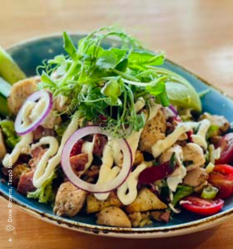
Dixie Browns, Taupō town