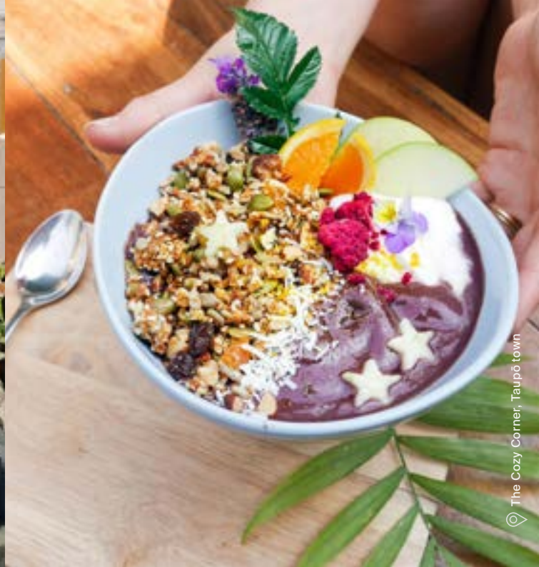
© The Cozy Corner, Taupō town