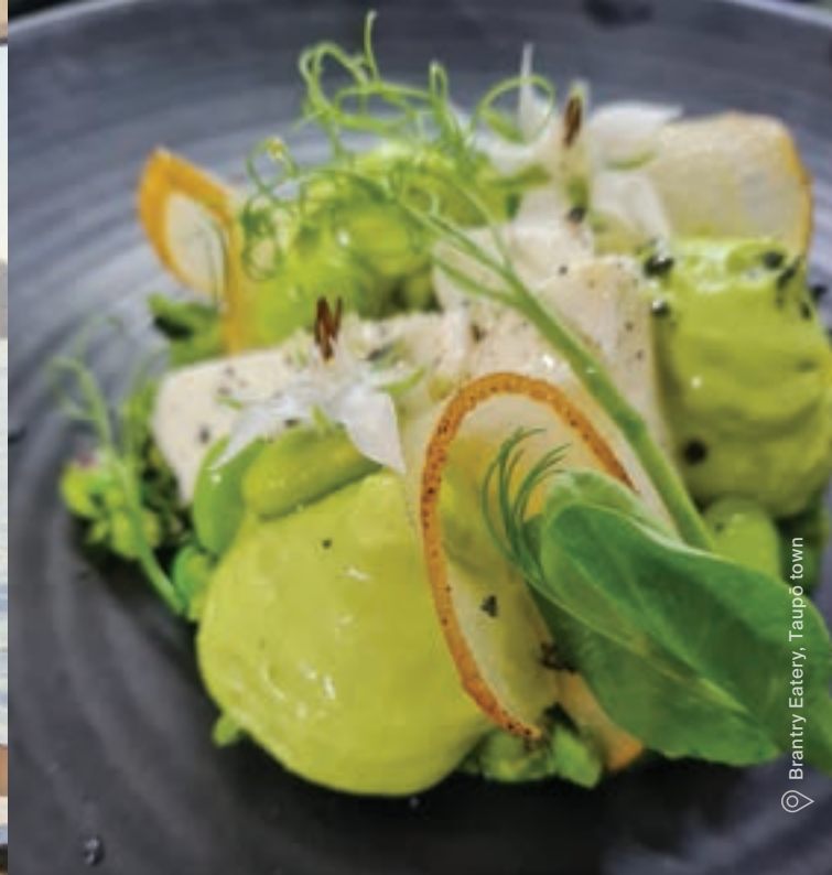
Brantry Eatery, Taupō town