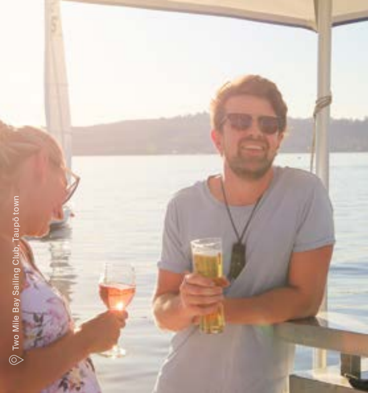
Two Mile Bay Sailing Club, Taupō town