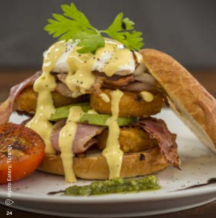
Hydro Eatery, Tūrangi