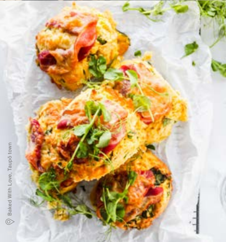
© Baked With Love, Taupō town