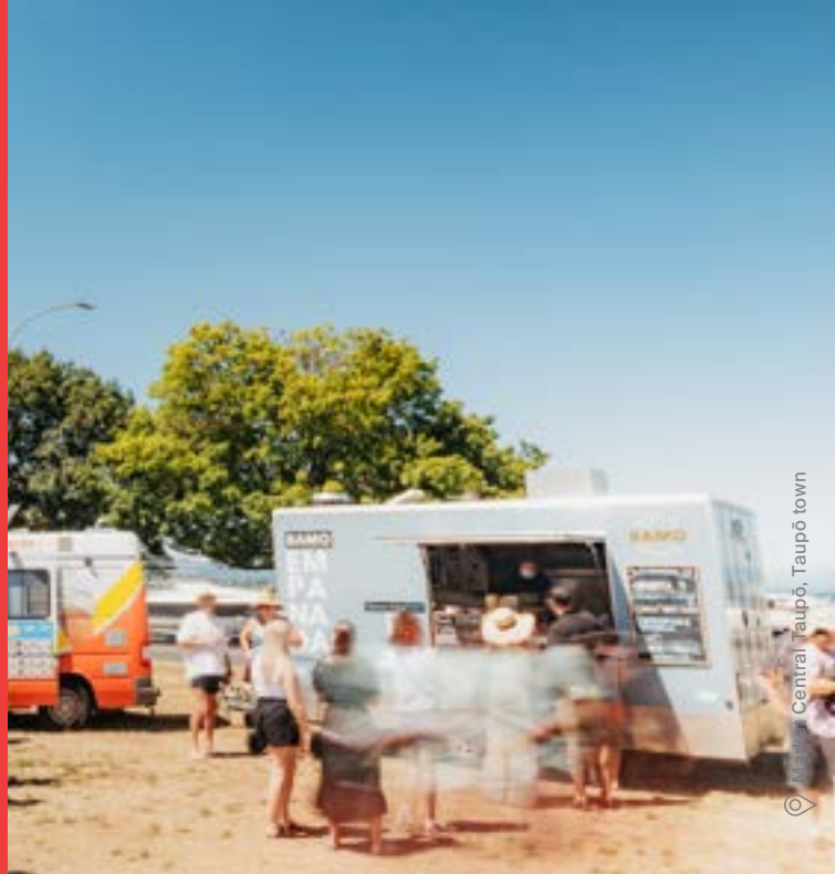
Central Taupō, Taupō town

For those who are still peckish shopping through Taupō towncentre, fresh-made fudge will satisfy your sweet tooth, or shop locally sourced, zero-waste groceries. Find ingredients that are good for you and the planet.